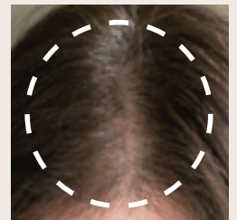
AFTER 2 MONTHS**